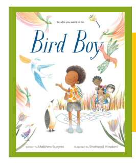
Bird Boy by Matthew Burgess illustrated by Shahrzad Maydani

Check out this collection of books to inspire your next bird watching adventure!