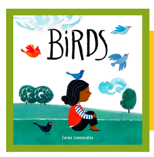
Birds by Carme Lamniscates